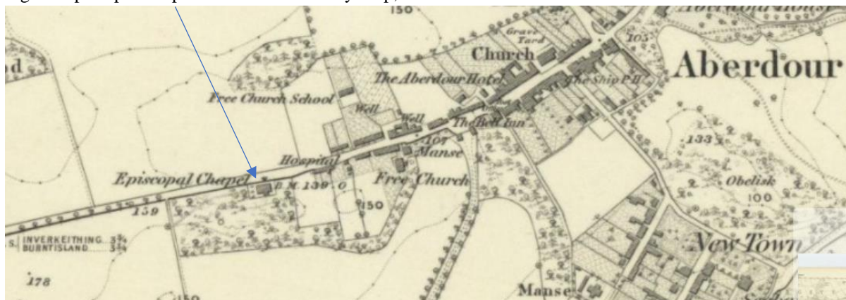
Fig 11. Episcopal Chapel on Ordnance Survey Map, 1854. 72