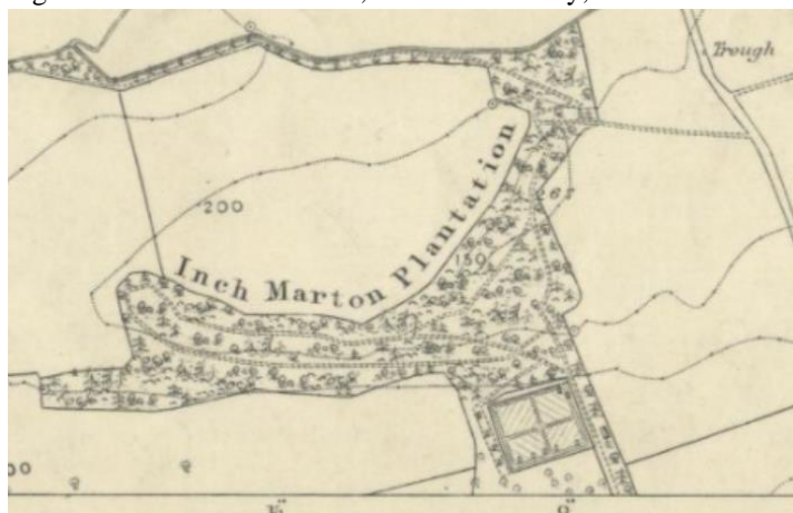
Fig 3. Inch Marton Plantation, Ordnance Survey, 1853-56. 4

A charter dating from 1347x55 is the earliest record of the land of Eglismartin (the 'Church of (St) Martin') which was located in the eastern part of the parish of Aberdour. 5 Names with the Eglis or Eccles element, short for Latin Ecclesiastes or Ecclesia meaning church, tend to indicate religious foundations dating back to the Pictish era (pre-900). Elsewhere in Fife, the