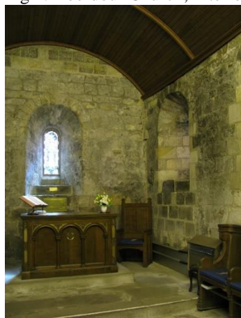
Fig 4. Aberdour Church, Interior, Chancel. 9