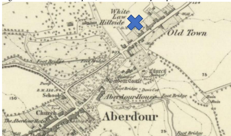
Fig 6. Former site of Hospital, Ordnance Survey Map, 1854. 23

James Douglas, 1 st earl of Morton (d.1493) founded St Martha's hospital in Aberdour in 1474, close to a holy well dedicated to St Fillan. The water from the well was believed to cure nervous ailments, blindness, and deafness, and it was intended that the vicars of the parish church of St Fillan should be the rectors of the new