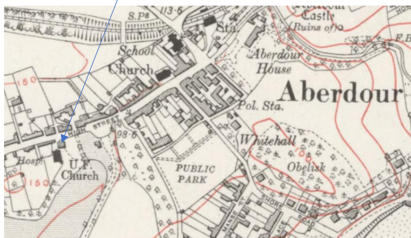
Fig 10. United Free Church on Ordnance Survey Map 1921. 68

In 1840 Leighton noted that no dissenting congregation was found in the parish of Aberdour, although the minister Hugh Ralph, labelled 70 families as seceders in 1845. 69 Shortly after the Great Disruption in 1843, a Free Church congregation was founded in Aberdour. They opened a church, called St Colme's, in