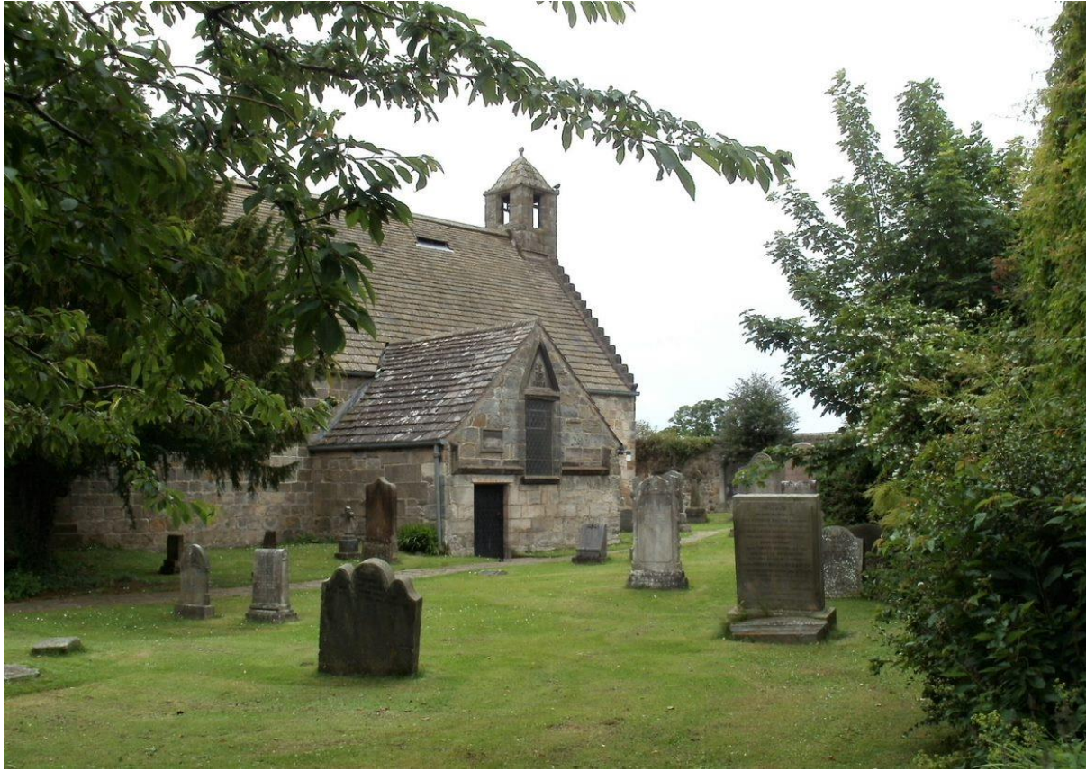
Fig 7. Aberdour Church with Bellcote c.1588.