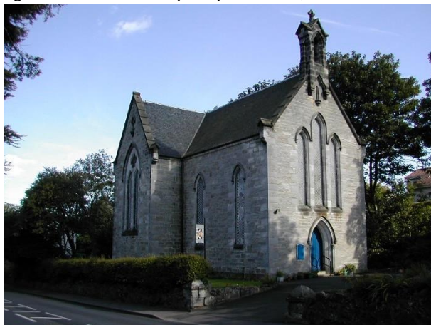
Fig 12. St Columba's Episcopal Church, Aberdour. 75

1845 Hugh Ralph (Minister) New Statistical Account