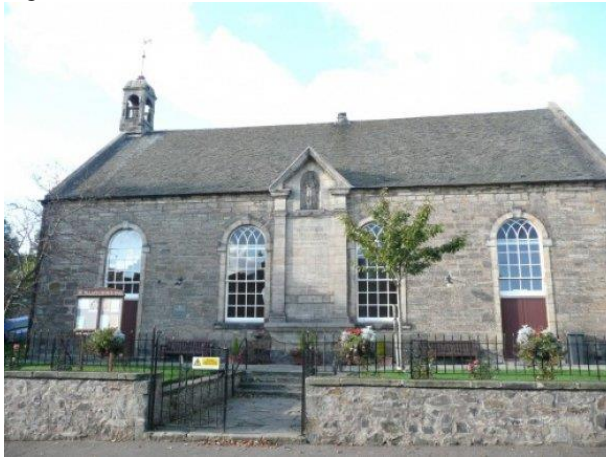
Fig 8. Aberdour Former Parish Church. 62

For much of the eighteenth century the location of St Fillan's Church so close to their country seat at Aberdour Castle had been a point of contention for the Douglas family. In 1790 they successfully closed St Fillan's and opened a new church in Wester Aberdour. 63 It was located close to the main road, but was considered by some observers to be too distant from some of the northern parts of the parish. The church received few additions in the relatively short time that it was in use, aside from a striking war memorial built in